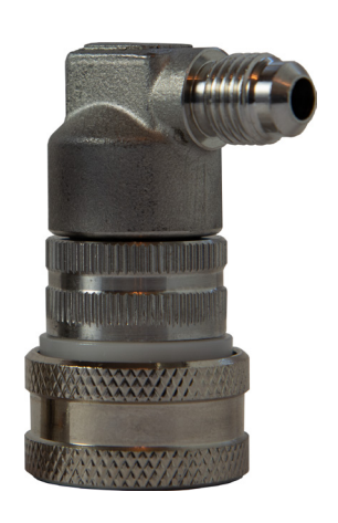
304 Stainless Steel Ball Lock Disconnect - 1/4" MFL (Gas)