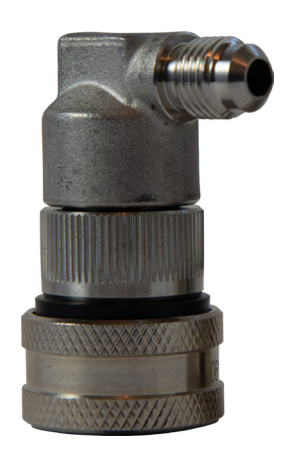
304 Stainless Steel Ball Lock Disconnect -1/4" MFL (Liquid)