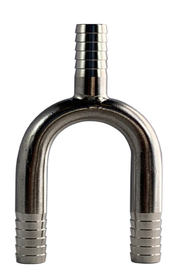
5/16" U-Bend Manifold, 304 SS