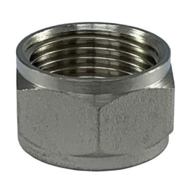
Beer Hex Nut SH-470