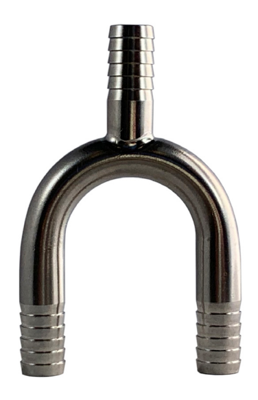
3/8" U-Bend Manifold, 304 SS