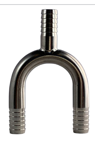
3/16" x 5/16" U Bend Manifold, 304 SS