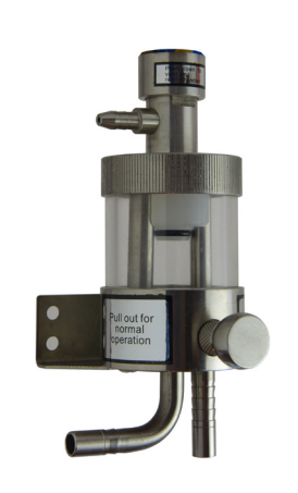
DRAFT SPECIALTY EQUIPMENT PAGE 30