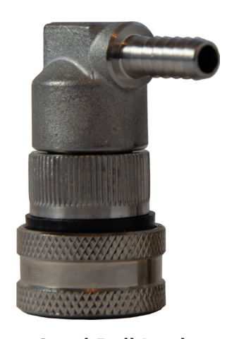
304 Stainless Steel Ball Lock Disconnect - 1/4" Barb (Liquid)