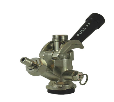
KEG COUPLERS & PARTS PAGE 10 - 11