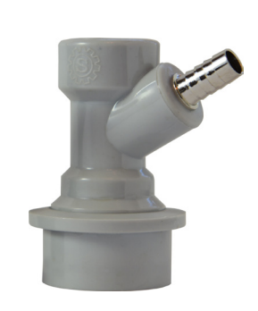
KEG DISCONNECTS & PARTS PAGE 26 - 29