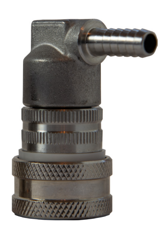
304 Stainless Steel Ball Lock Disconnect -1/4" Barb (Gas)