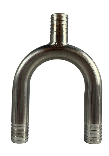
1/2" U Bend Manifold, 304 SS